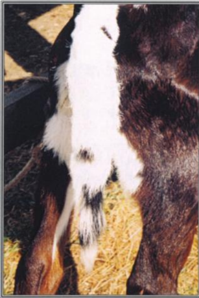
Spots of colour on the tail (CT)