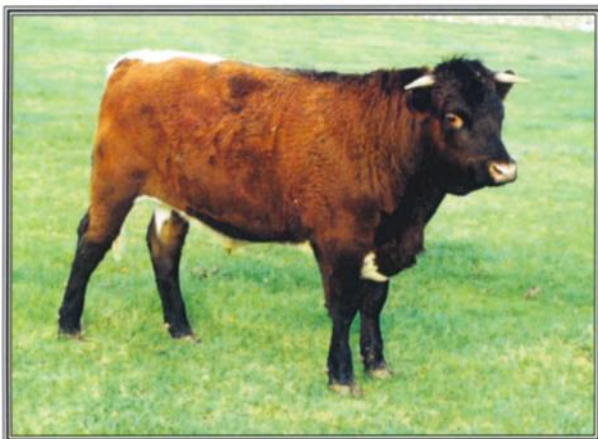
Pink skin on nose (PN)

(CT acceptable for female registration with no asterisk)