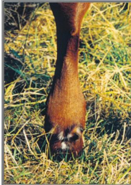
White hairs on heel (WH)