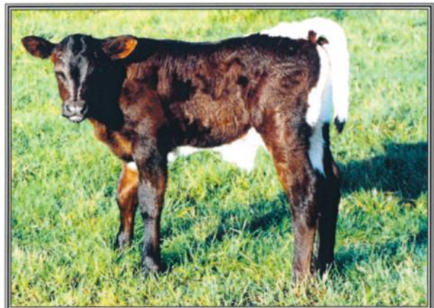
Coloured switch (CS)

Usually associated with pink skin around the eyes and a light body colour